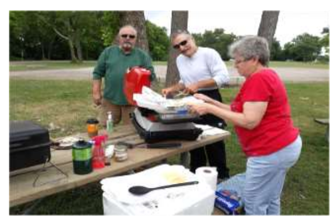
Water Wonderland Tunderbird club PO Box 2597 Taylor, MI 48180