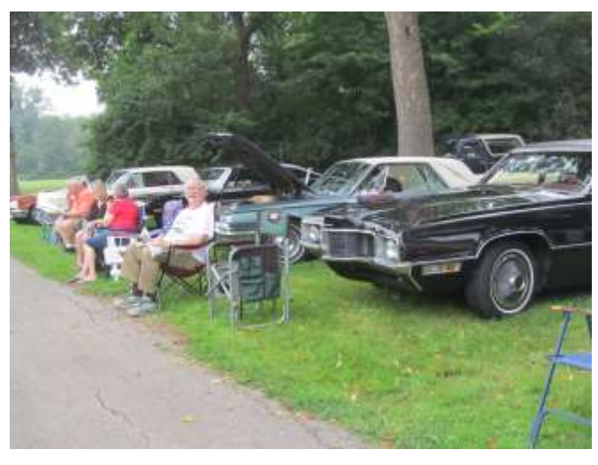
Water Wonderland Tunderbird club PO Box 2597 Taylor, MI 48180