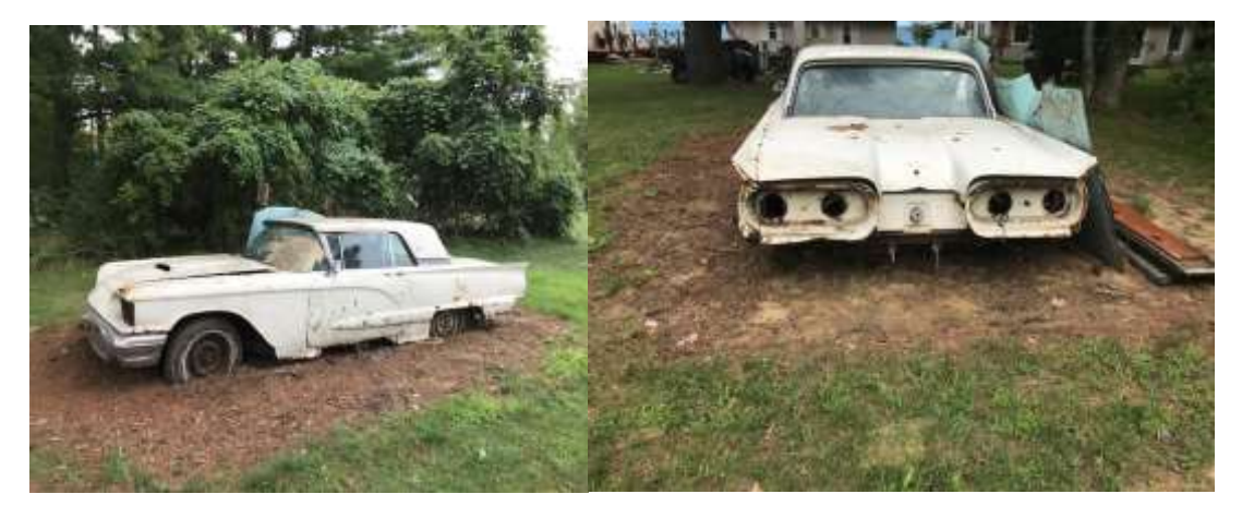
1959 Thunderbird Parts Car in Lexington, MI. Many good condition parts (Seats, windows, front bumper with grill including turn signal light hardware, 2 trunk lids, and many, many more parts. Asking $500.00 or OBO for all including body.