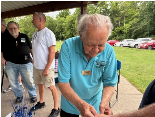
Brought His Own Keys!