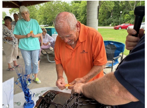
Professional Lock Smith