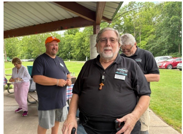
Future Pizza Maker!